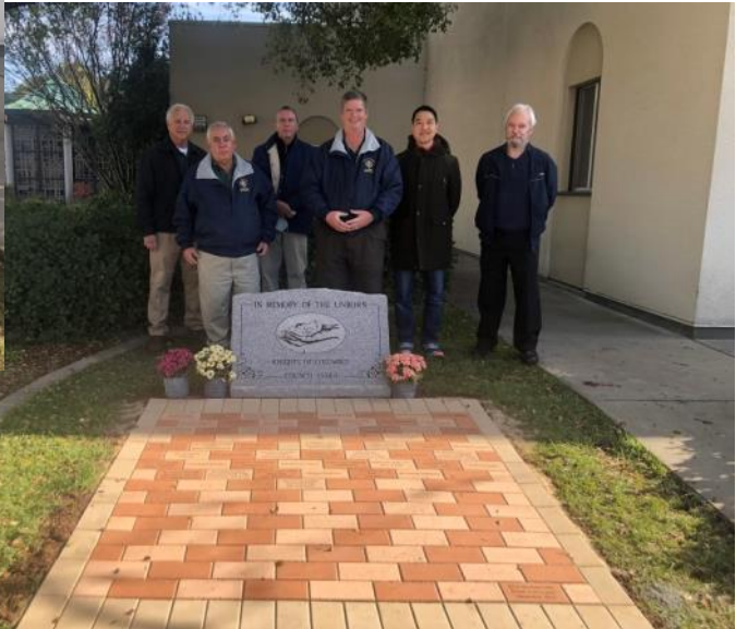
↓ The Brothers – Unmasked.